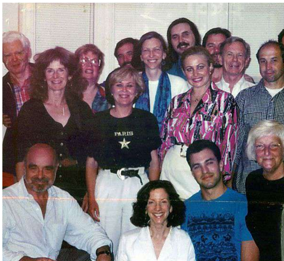
6 week Seminar in San Francisco, June 1993